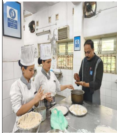
Culinary masterclass by senior faculty/guest chef – Gujarati specialty demonstration