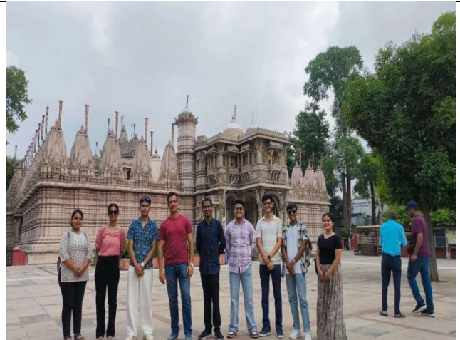
Dekho Amdavad City Tour