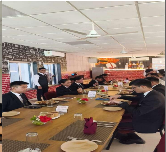
Each group presents their IHM's regional cuisine, unique training practices, and cultural insights