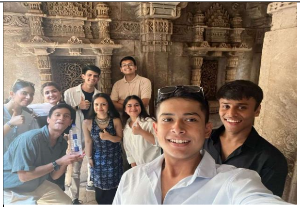
Half day Tour to Adalaj ni Vav