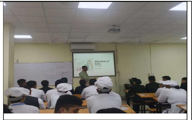
AIHM Students attending regular theory class of the IHM Ahmedabad