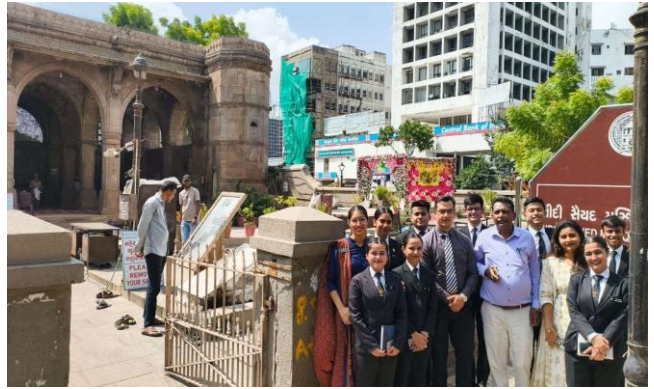
Heritage site visit to Sidi Saiyyid ni Jali, Lal Darwaja, Ahmedabad