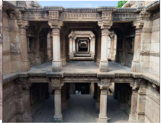
Half day Tour to Adalaj ni Vav