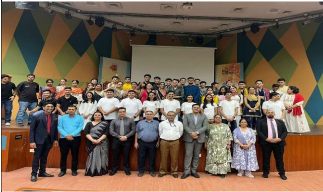
Cultural Night: Joint performances by visiting and host students in IHMA Auditorium