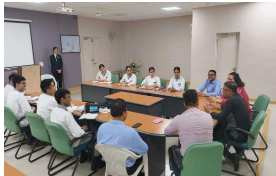
Faculty interaction: Sharing teaching techniques & kitchen management practices