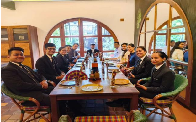
Industry visit to The House of Mangaldas Girdhardas, Ahmedabad